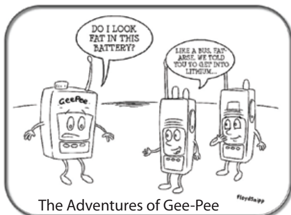
The Adventures of Gee-Pee